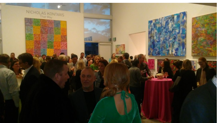
Nicholas Kontaxis' feature painting (above) appraised at $24,000 - sold - at the main wall of the exhibit. Below, other major works by Nicholas Kontaxis.