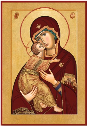
The Icon: "Virgin of Vladimir"

The following excerpts from the writings of St. Nectarios of Pentapolis and Henri J. M. Nouwen help to crystalize for us the influence of the Theotokos in our lives, which includes both our outlook on life in general and our life of prayer in particular. These excerpts, I believe are helpful also on the basis of the mystical influence of the Theotokos in terms of our deeper spiritual life as is communicated through the Holy Icons. In this way, I hope that we all come to a renewed frame of mind called for by asking the Theotokos to intercede for us as we commit ourselves to Christ our God. This is the best way for us to cele-