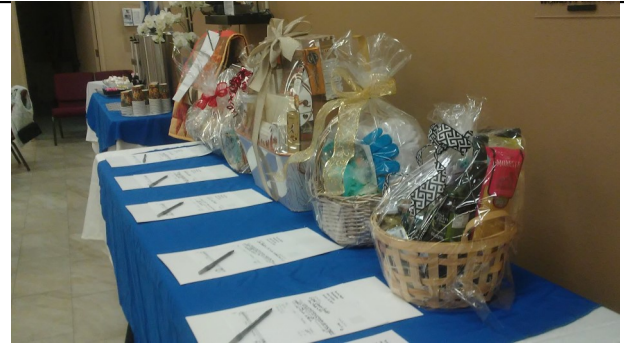
Above: Silent Auction items for Taverna Night were arranged in beautiful fashion.