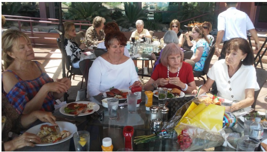
May Philoptochos Luncheon - View of Philoptochos members enjoying the annual May Luncheon.