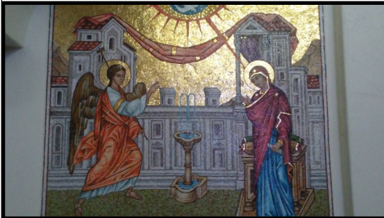
<----- The Annunciation