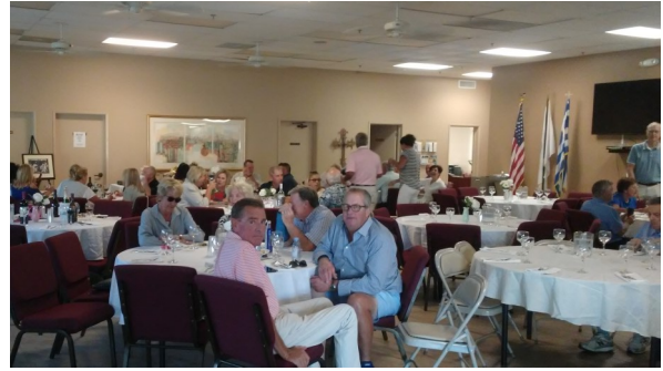
The parish hall begins to fill up with guests attending this year's annual St. George parish Golf Tournament.

Everyone is welcome to come back next year for our St. George parish Golf Tournament, which is tentatively scheduled for Saturday, April 25, 2020 .