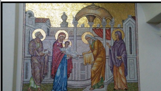
<----The Presentation of Christ in the Temple