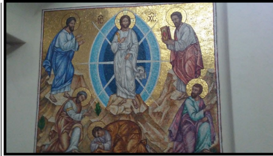
Our newly installed Icons: <---The Transfiguration of our Lord