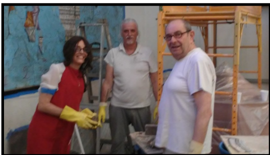
Bottom Picture: Work begins to install the Icon of Pentecost.