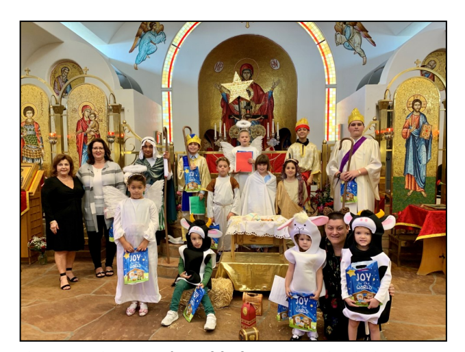
The "Grand Finale of our 2019 Sunday School Christmas Pageant