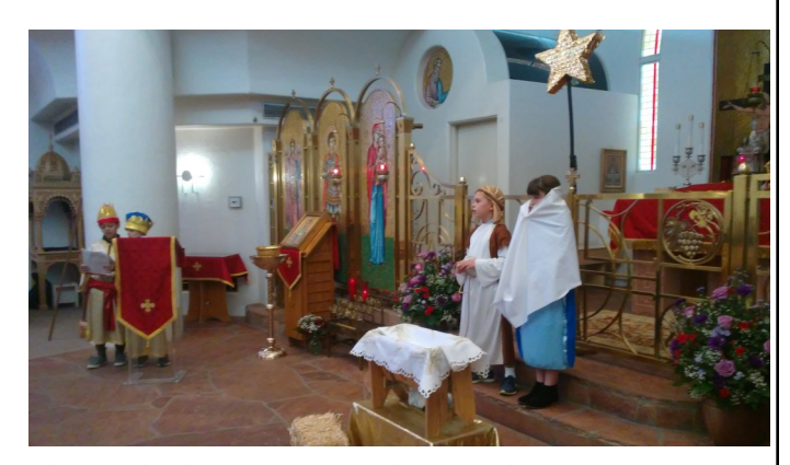
This year's Christmas Pageant began with narration given from the Holy Scriptures as the Nativity program unfolded