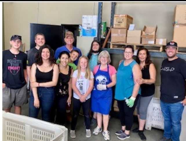
Pictured above: Representatives of our parish Philoptochos, AHEPA and our Sunday School organizations came together to help prepare deliveries of food for the homeless in Coachella Valley. Their efforts were in support of the Narrow Door organization, which is committed to help the hungry on a daily basis.