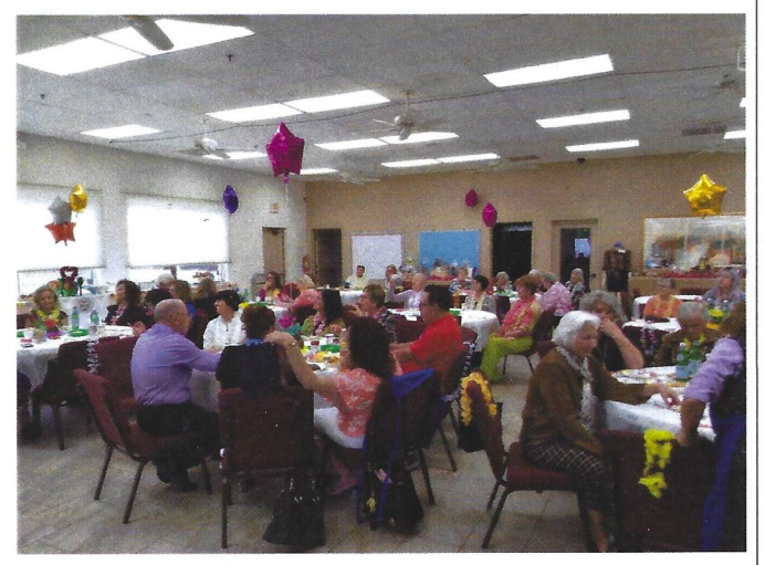
50+ parishioners at the Philoptochos Membership luncheon