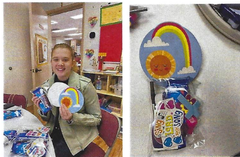
Sunday School included prayers and verses from the Bible in helping with the Philoptochos hygiene kits.

the blessing of Holy Water for their homes.